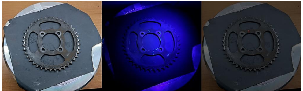
Defects detected and classified by the system

Myelin Foundry's product is a plug n play edge device that can be installed along with a one, two or three-camera setup in workstation with the capability of handling feed at near time basis with near zero latency. This AI powered device seamlessly analyses samples and annotates defects on images making it easier for the inspector to identify and classify defects.